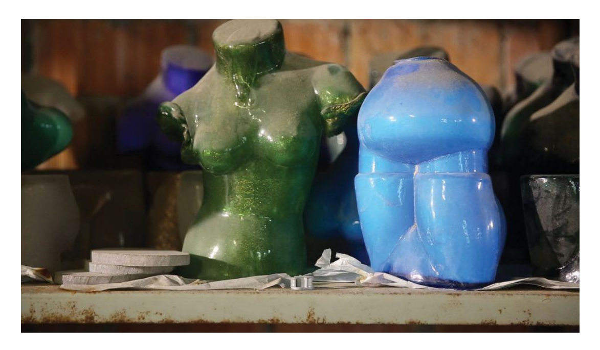
Cammock's film Chorus was inspired by the Baroque period. The film formed part of the show Che si può fare Chorus: Courtesy the artist © Helen Cammock