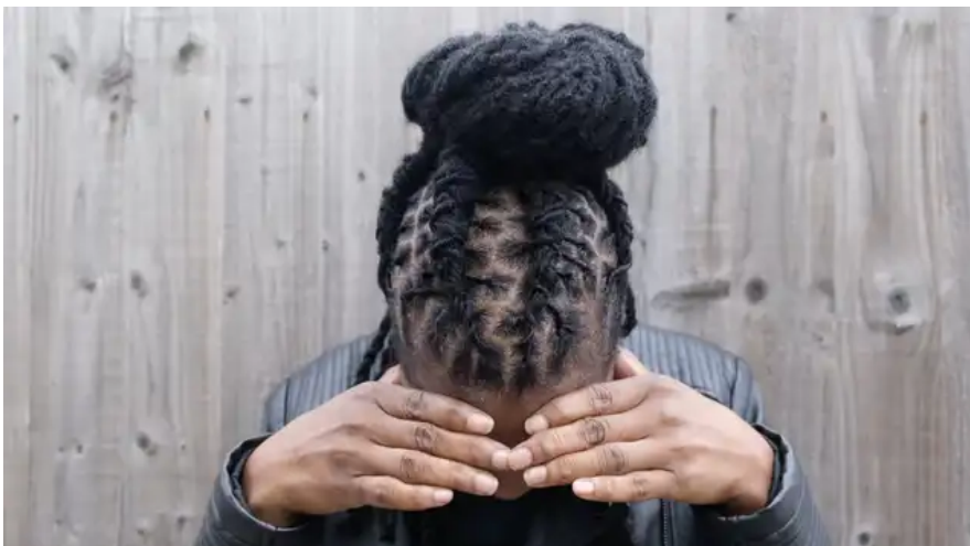
Helen Cammock, ‘Bass Notes and SiteLines The Voice as a Site of Resistance and The Body as a Site of Resilience, 2022 / Production still

It’s tremendously difficult, of course, but also there are messages of hope, solidarity, even advice. We see the four of them with each other, dancing and engaging in what look like trust exercises – literally exercising care.