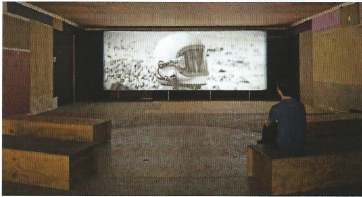
From left: Ben Rivers, The Two Eyes Are Not Brothers , 2015, mixed media, five-channel digital video projection (color, sound, infinite duration), Installation view, Television Centre, White City, London. Ben Rivers, The Sky Trembles and the Earth Is Afraid and the Two Eyes Are Not Brothers , 2015, 35 mm, color, sound, 96 minutes.